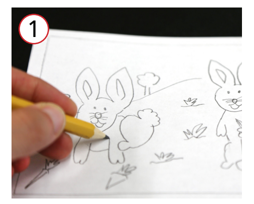
Trace the outside of a printing board on a blank sheet of paper. Design your print inside the lines with pencil. Remember that everything you draw will print backwards!

For this project, you will etch into a foam printing board to create your own design and use it to print onto cards. Please keep in mind that your printing boards are extra fragile, so be careful not to ding or dent them!