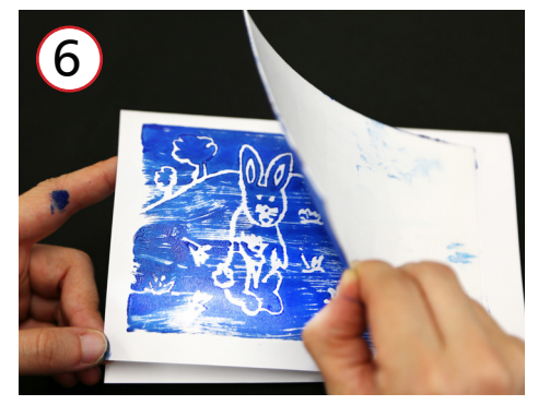
Continue to create test prints until you perfect it. Once you feel comfortable, start printing onto your cards. Once it is printed, allow 24 hours to dry.

For more information and for video tutorials please go to youthfiberart.org! Ink is non-toxic, non-flammable, water based, and contains no solvents. If ink gets on skin, wash with warm soapy water. Intended for ages 9 and up.