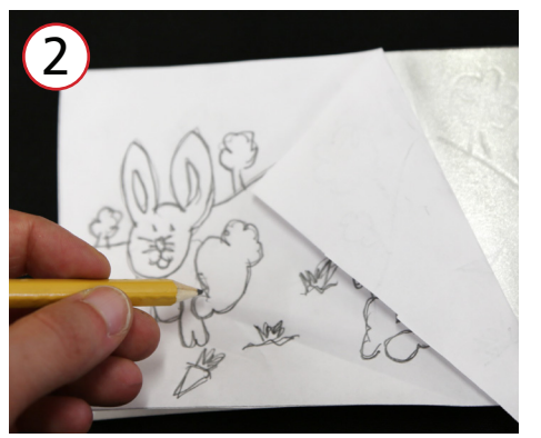
Once you have your design drawn on paper, cut it out and lay it on top of your printing board. With a light pressure, trace over your lines, leaving a slight imprint on the printing board.